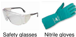
Safety glasses Nitrile gloves