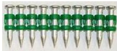
0.145-inch Diameter (3.7 mm) Straight Shank C4 Fasteners