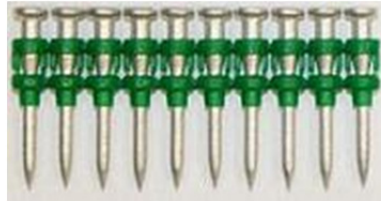
0.145-inch Diameter (3.7 mm) Step Shank C4 Fasteners