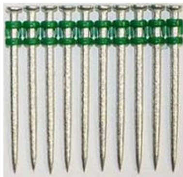
0.137-inch Diameter (3.5 mm) Taper Shank C4 Fasteners